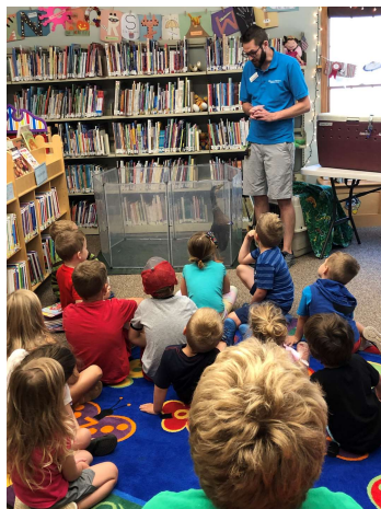
Story Hour Seneca Park ZooMobile