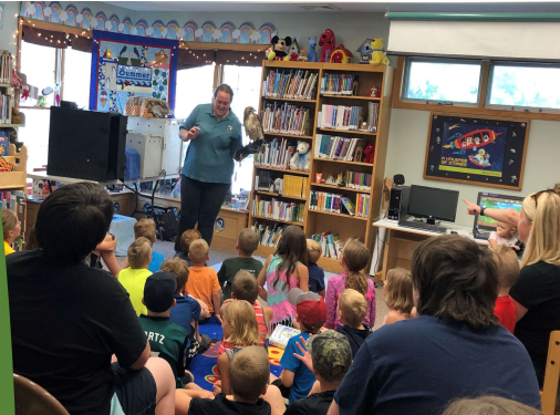
Summer Read 2019 Hawk Creek Wildlife Center